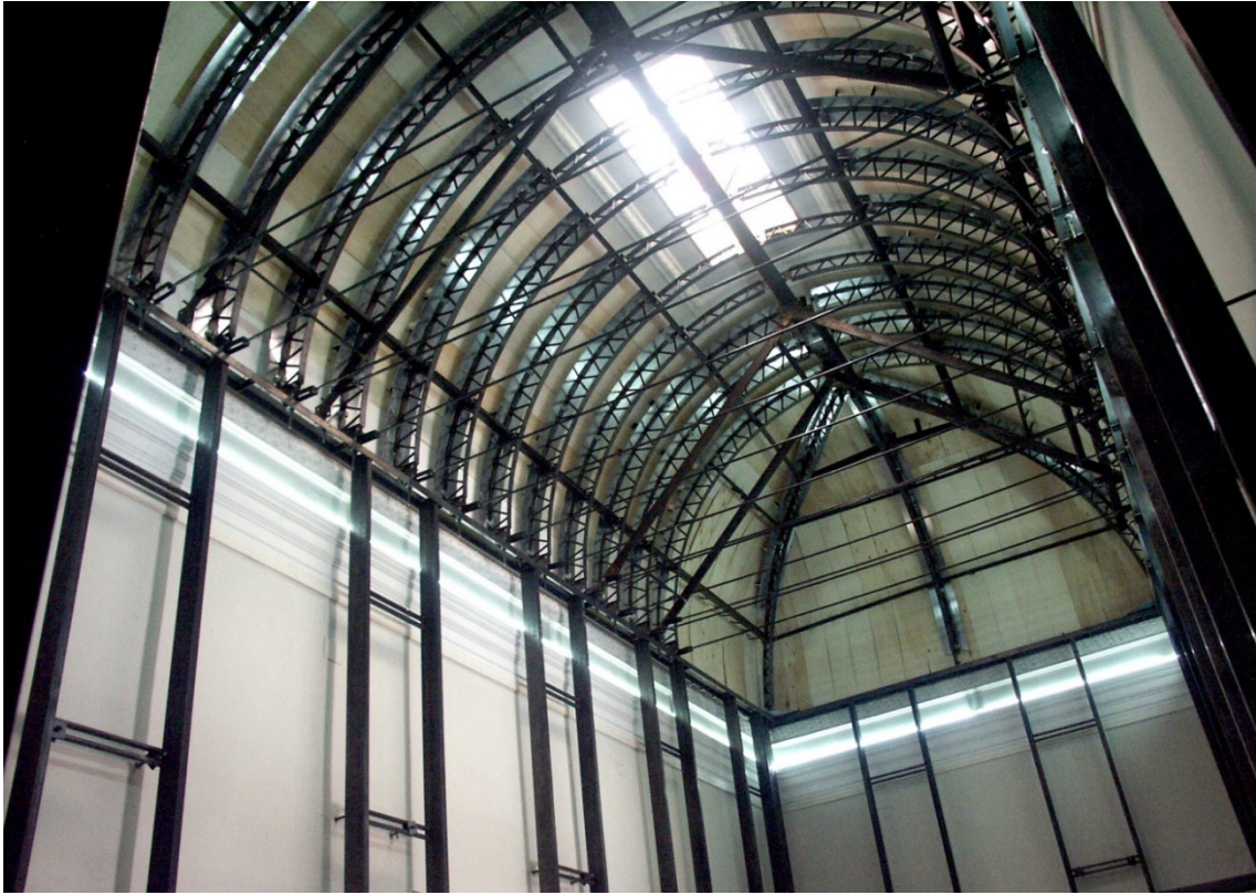
Fig. 4 Case study A—Cecina, Italy: overall view of the realized structure.