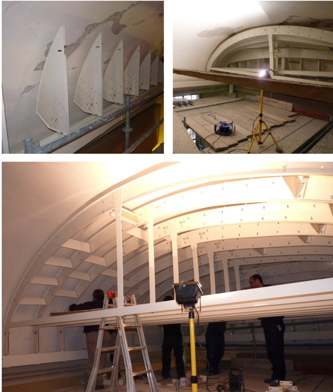
Fig. 6 Case study B—Structure assembly steps.

The protection realized was in both cases a steel counter-vault, placed at the intrados of the vault, with the function of non-pushing shoring, which is more evolved from a constructive, logistical and aesthetic point of view. In both cases, the aim was to avoid overloading the underlying floor with vertical shoring structures that would also have been an encumbrance to the use of the spaces.