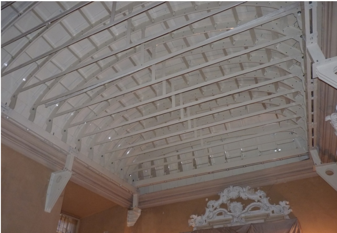
Fig. 5 Case study B—Cecina, Italy: overall view of the realized structure.