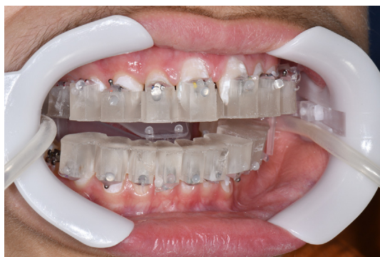
Fig. 1 The isolation of the operative field and insertion of CAD-CAM transfer trays in the correct position.

a total of 10 s. The techniques for single-component orthodontic adhesives were identical in the GC group, with the exception that no primer was used and the GC Ortho Connect composite was used instead of Gradia. The transfer trays are inserted into the mouth by the use of tweezers. Once the composite is cured, the transfer trays are removed, applying pressure from the palatal side of the tray to avoid the bracket debonding.