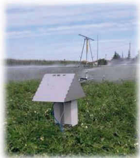
Fig. 1. Portable sensing unit in tomato field during sprinkling irrigation.

respectively. After a lab-calibration, we selected 8 MOX gas sensors to integrate in the two dedicated hardware (see Fig.1), each consisting of: a double protection and compact size outdoor box, 4 aluminum test cells for direct flux exposure, humidity/temperature sensors, a firmware for the real-time signal acquisition, the remote management of the measuring system, storage, data transmission, setting of the operating parameters.