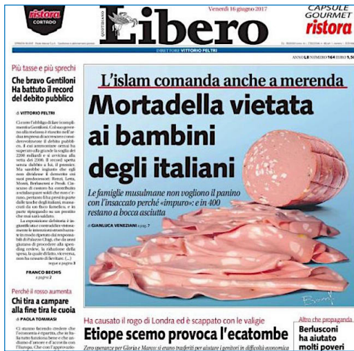
Figure 2: “Islam Also Rules on Snacks at Schools, Mortadella Banned for Italian Children.” 9

Recently, a fake news about the refusal to host a Christmas party at a primary school with the presence of Muslim students was recalled by a famous “democratic columnist” in Corriere della Sera , the most important Italian newspaper.