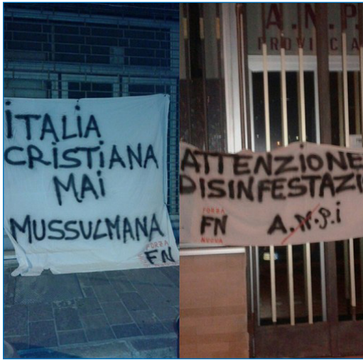
Figure 1: In Savona (Liguria) Forza Nuova put up the Islamophobic banner “Italy Christian, Never Muslim” and a banner against the National Association of Partisans.

program “to fight the Islamization of society and to defend the Italian rules and culture.” The Facebook page of this ethereal party was visited and shared by thousands of people in a short time and, recently, the page reached almost 18,000 followers.