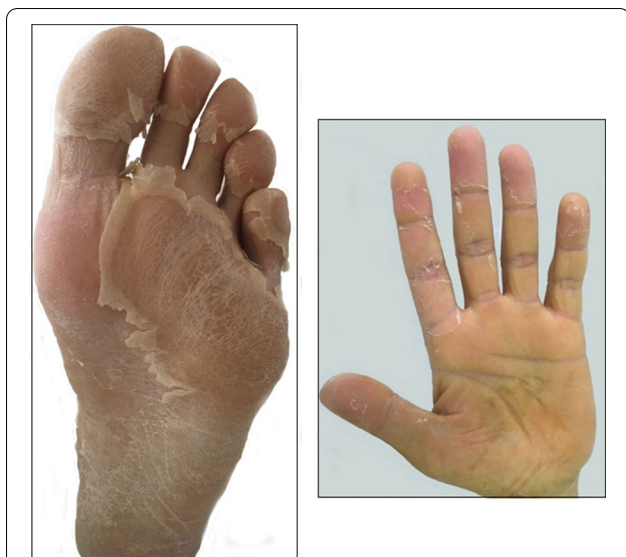
Fig. 1 Lamellar desquamation of the palms and foot on 22th day of hospitalization