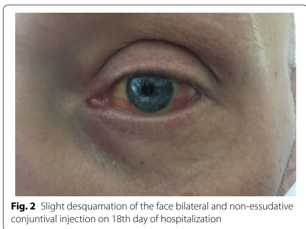
Fig. 2 Slight desquamation of the face bilateral and non-exudative conjunctival injection on 18th day of hospitalization

small bilateral laterocervical lymph nodes not painful. Furthermore, bilateral non-exudative conjunctival injection and slight desquamation of the face (Figs. 1, 2), lip cracks, dryness and lamellar desquamation of the palms of the hands and feet were present; in the following day the peeling of the hands and feet progressed dramatically (Fig. 2).