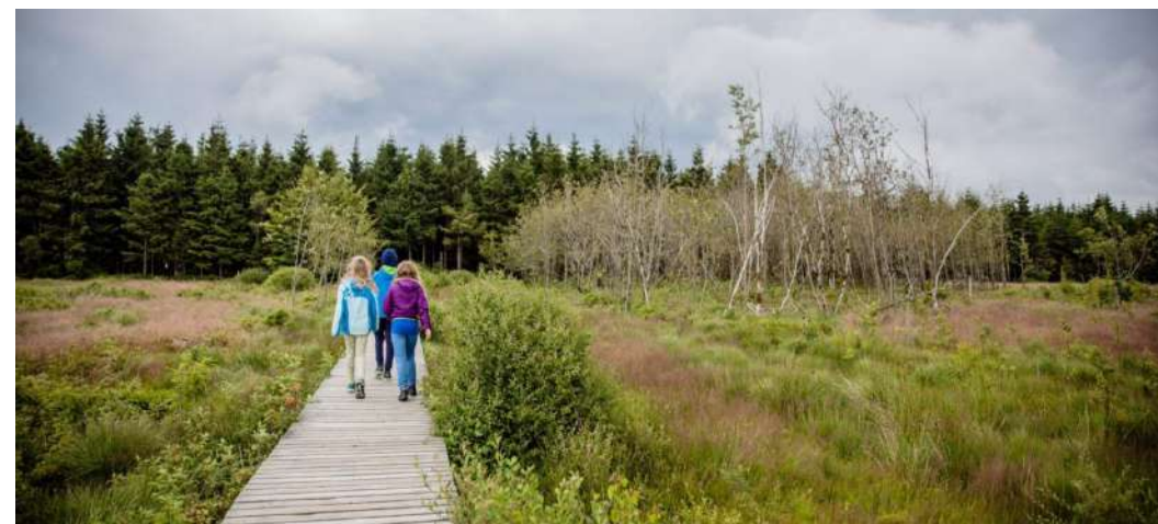
Fig.7 / "Go Eastbelgium" an innovative LEADER project promoting hiking in the Belgian Eifel area by means of an online hiking planner tool, GPS navigation and a smartphone app.