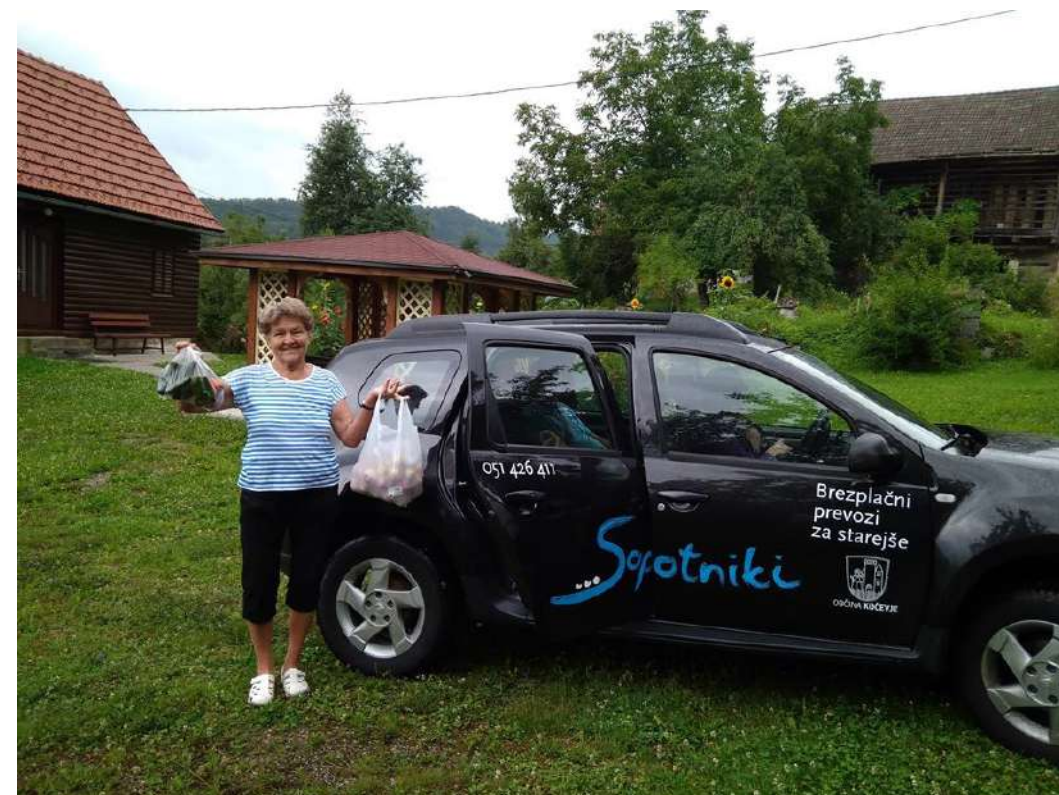
Fig.4 / Cotravelling against elder isolation in rural areas.

I Briganti del Cerreto is a successful community-based initiative, recently inserted by the UE among the 20 innovative practices, the only one from Italy, in the tourism sector. Cerreto Alpi is an enchanting village made of chestnut and stone in the Apennine at the border between Emilia Romagna and Tuscany,