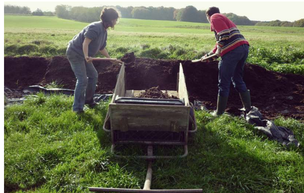
Fig.8 / Nos Oignons supports social farming with health benefits in Wallonia.