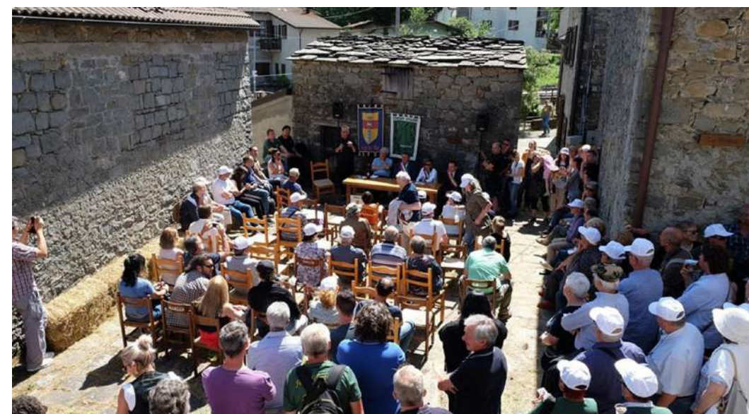
Fig.5 / Community-based tourism is about direct initiative of rural people.

suffering from depopulation since the second half of 1900; in 2003 a small group of young residents, instead of moving away, decided to play an active role in stopping the trend and tried to revitalize the social and economic life of the area with the involvement of the entire community.