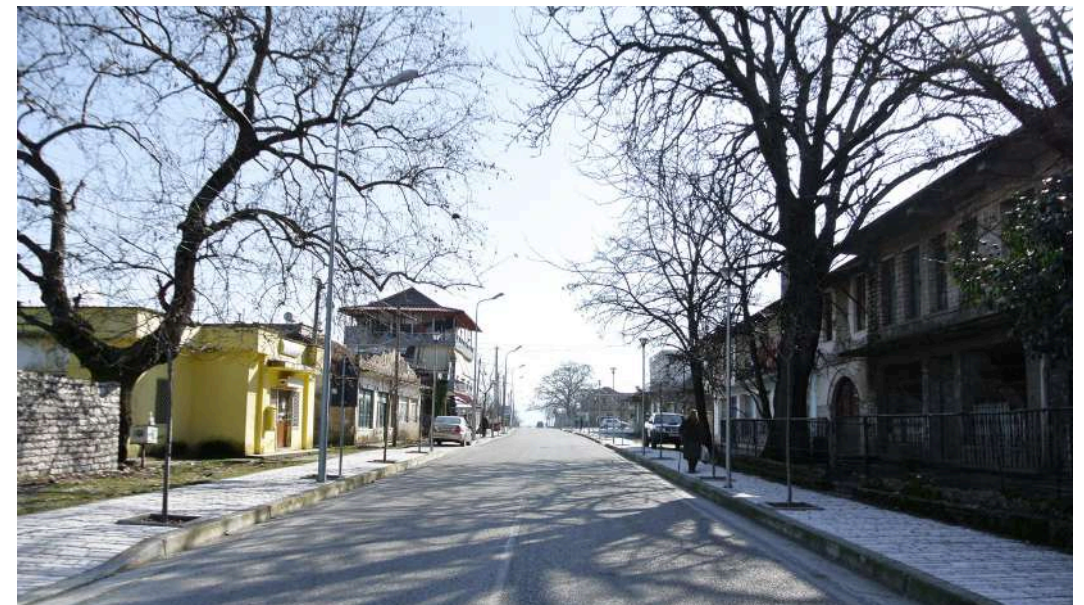
Fig.2 / Jorgucat central road, on which many dismissed buildings overlook.

The Population and Housing Census taken in 2011 in Gjirokastër County registered that over a number of 971 persons in the southern area of Dropull, only 73 private households have a car. Given the lack of public mobility options in this rural area,