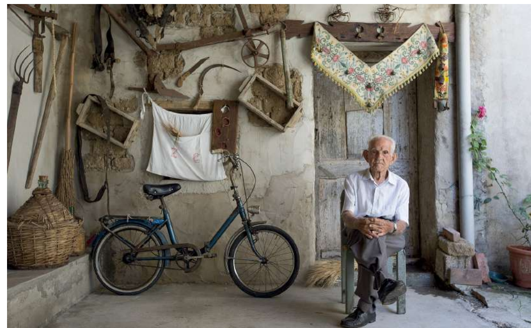
Fig.6 / Sardinian veterans in Villagrande Straili, one of the five Blue Zones

This study proposes a set of options in line with Jorgucat potentialities: if further developed, this may be the starting point to design for solutions at different scales, tailored to the Dropull community and more generally those shrinking rural villages with an agricultural vocation.