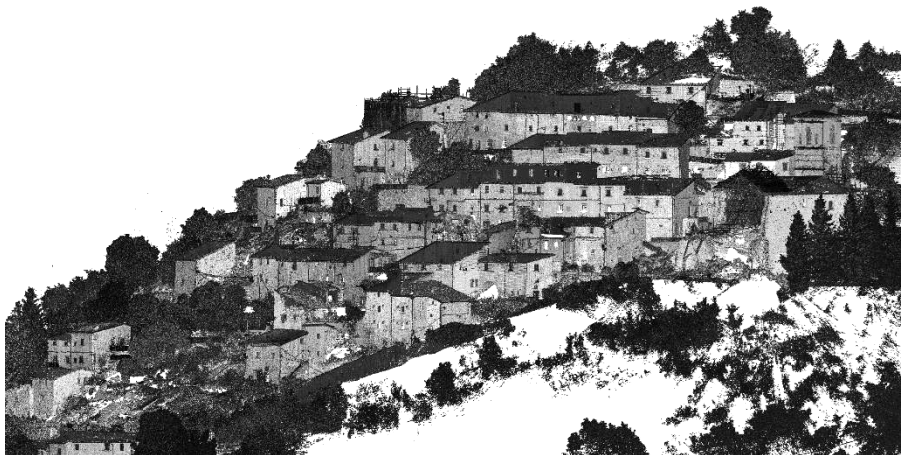
Fig. 2 Campi di Norcia (PG) a panoramic view of historic centre

Concordia sulla Secchia (MO) una planimetria del centro storico