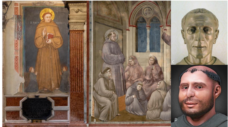
Fig 1. The representation of St. Anthony. (A) St Anthony giving his blessing, Giotto School. This portrait is considered to reflect the true effigy of the Saint. Padova, Basilica del Santo (1238–1310), Giovanni Pinton/ Archivio Fotografico Messaggero di Sant’Antonio, 2020. (B) Giotto, St Francis appears in the Chapter of Arles, ca. 1295–1299. Assisi, Chiesa Superiore of Basilica di San Francesco. In the detail, St Anthony is illustrated suffering, with a bloated abdomen. (C) Bust of St Anthony, detail. Bronze sculpture by Roberto Cremesini, 1995. This is a scientific reconstruction of the ‘real’ face of the Saint, based on the skull found after the recognition of his body in 1981. In the reproduction of this bust, the artist relied on the advice of three scholars: C. Corrain (anthropologist), V. Meneghelli (anatomist) and V. Terribile Wiel Marin (anatomopathologist). Photo by Giorgio Deganello/ Archivio Fotografico Messaggero di Sant’Antonio, 1995. (D) The 3D Forensic Facial Reconstruction of St Anthony of Padua. Cicero Moraes—Opera propria, CC BY 3.0, https://commons.wikimedia.org/w/index.php?curid=33660858 .

https://doi.org/10.1371/journal.pone.0260505.g001