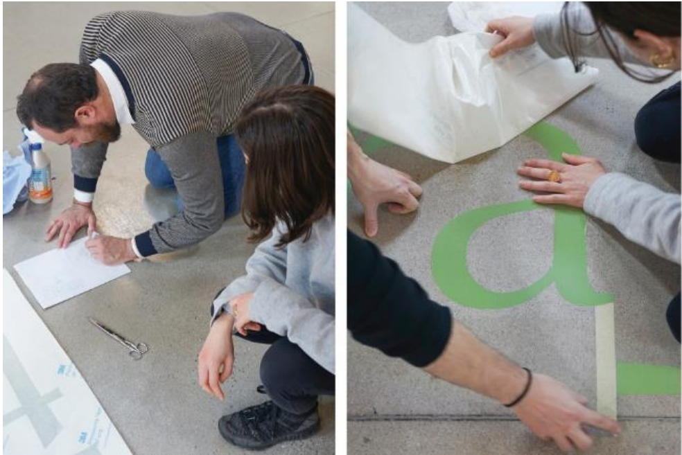
Figure 2. Teachers and students working to the exhibition Natura Naturata at the University of Ferrara (2019).

design and creation of the narrative elements of the exhibition (banners, section panels, display cases, catalogue of the rare books and of the students' projects), posters and postcards were created to promote the event. As well as the work of coming up with concepts for the design of the exhibition this was also an opportunity for students to get out of the classroom and become involved personally in the construction of the exhibition with its technical aspects and logistic organization.