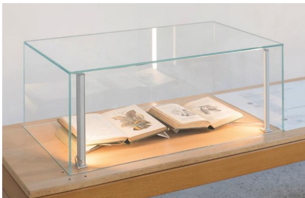
Figure 1. Natura Naturata exhibition of rare books at the University of Ferrara (2019).