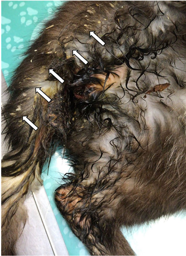
FIGURE 1 Clinical aspects of a cutaneous myiasis in a domestic cat by Calliphora vicina (Case 1): lower abdomen and inner side of thighs showing dipteran larvae (arrows) on the fur

Italy), was admitted at a veterinary clinic on 11 April 2018 after she had been run over by a car, suffering a debilitating pelvis fracture followed by immobility. In the lower abdomen and inner side of thighs, the presence of larvae in the fur (Figure 1) and over decubitus ulcers was noticed. A total of 26 live dipteran larvae, 5.98 \pm 0.67 mm long, were collected in the fur and over the decubitus ulcers. All other larvae were mechanically removed, the ulcers were washed with hydrogen peroxide and the anti-inflammatory drug meloxicam was prescribed.