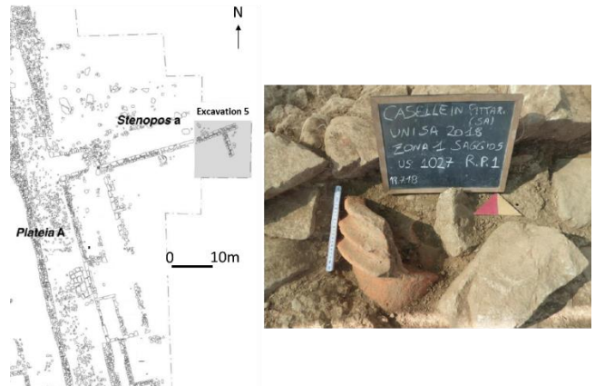
Figure 4: The first materials recovered by the excavations after the geophysical measurements realized close to the stenopos intercepting the plateia A (excavation 5)

The data interpretation of the geophysical results is also supported by the archaeological excavations realized in limited portions of the site after the geophysical acquisitions. In particular, the excavation 5, with sizes 5x5 m, have brought to the light the perimetral northern wall of the “ Casa in tecnica a scacchiera ”, highlighting the northern-eastern corner on the walls of the structure. Further, a fair amount of ceramic material was found including some ancient objects, such as a lamp and a vase in addition to iron nails [4].