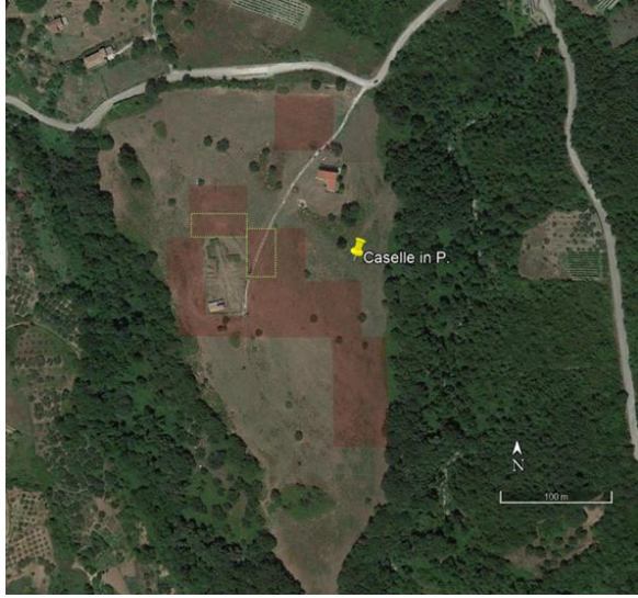
Fig. 2: The plateau investigated with MAG (in red the areas analyzed). The green rectangles show the areas, the results of which are showed in the paper.