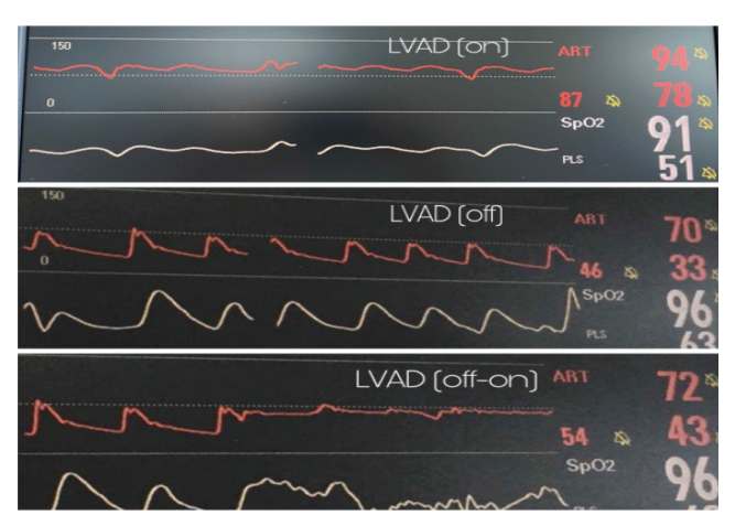
Fig.3 LVAD on-off-on

The hemodynamic were stable throughout the intervention. The debit of the LVAD pump was good, providing a satisfactory perfusion with an average