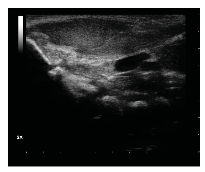
FIGURE 1: At the left side in the laterocervical region, there is a fusiform thickening of the ventral side of the the sternocleidomastoid muscle.