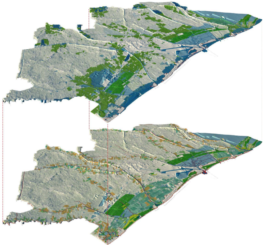
Fig. 2 / Scenario transfer, merging soft scenario (above) and rigid scenario (below).

6. Areas identification: by intersecting the criticalities of the Ravenna territory, the places of coastal tourist interest and the transfer scenario we extract the areas in which the intervention of defence, indistinctly rigid or soft, can be an element of protection and resilience compared to the CC, but also a new opportunity for tourism and economy of the seaside territory. The coast of the Municipality of Ravenna extends for 38 km and it has 198 beach properties distributed along 9 different seaside resorts: Casal Borsetti, Marina Romea, Porto Corsini, Marina di Ravenna, Punta Marina Terme, Lido Adriano, Lido di Dante, Lido di Classe, Lido di Savio.