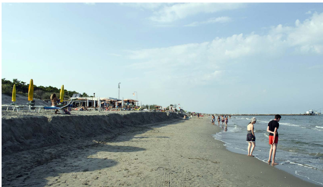
Fig. 1 / Coastal erosion in Marina Romea.