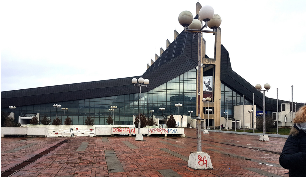
Fig6 / Palace of Youth and Sports, Prishtina, Kosova .

enrich the cultural heritage of Kosova . Other categories of users that need a special support are elderly, disabled persons, and all people needing special assistance; the public administration has to provide them appropriate services, facilities and public spaces.