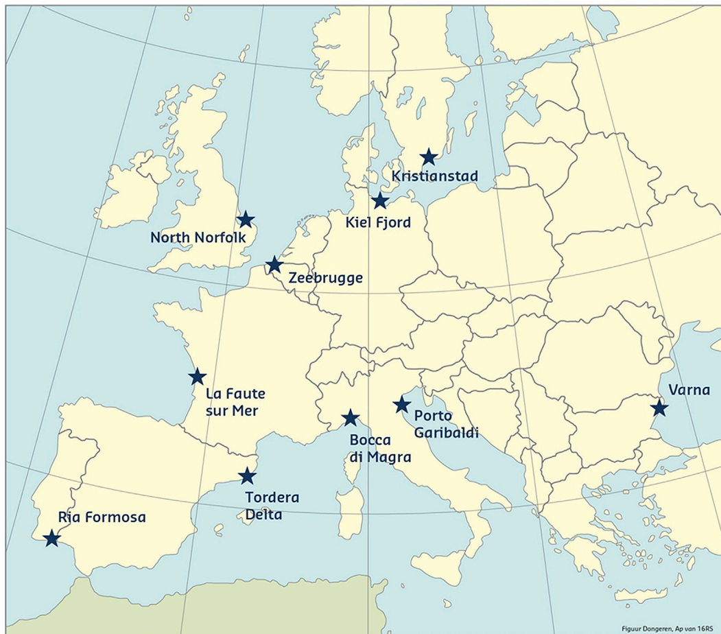
Fig. 4. RISC-KIT case study sites in Europe.

significant economic benefits for the entire Belgium), the North Norfolk Coast Special Area of Conservation (a Special Protection Area under the Ramsar Convention), the touristic areas of Porto Garibaldi-Bellocchio, Varna, Tordera and Bocca di Magra, the relatively local character of the Wendtorf (Kiel) marina and Praia de Faro occupation (local fisherman and residents), the national relevance of a well-known alcoholic spirit factory and Port of Ahus exposed at Kristianstad and the unquestionable disruptive effect on the population at La Faute-sur-Mer as proved by Xynthia storm in 2010.