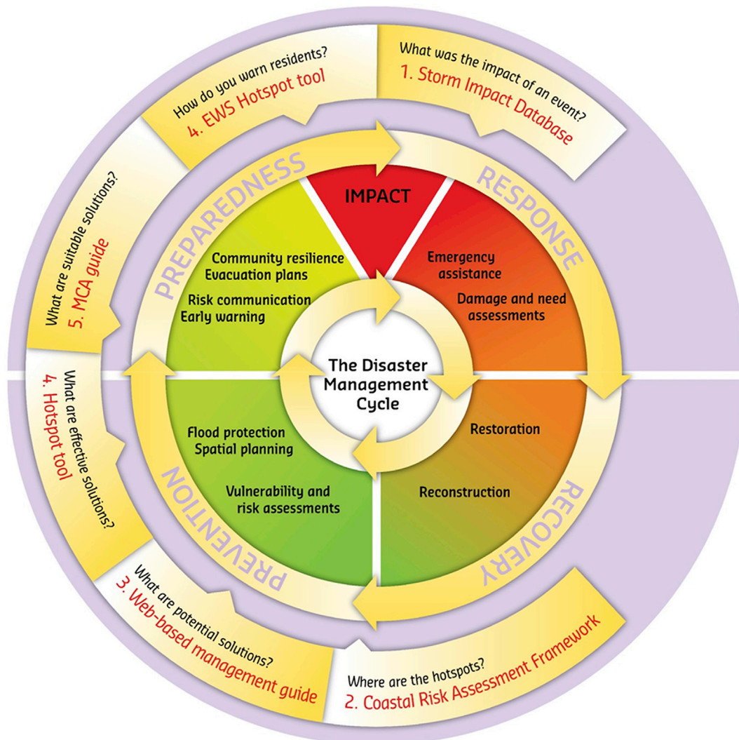
Fig. 1. The Disaster Management Cycle, describing the Response, Recovery, Prevention and Preparedness stages, and the place of the RISC-KIT tools in this cycle (figure adapted from an original by and courtesy of C. van de Guchte, Deltares).

These tools can be plotted on the Disaster Management Cycle (Fig. 1). This cycle describes the stages of action that take place after a disaster has occurred. First, there is the immediate Response such as emergency relief, then follows a phase of Recovery in which the affected area is