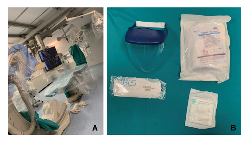
Figure 2 Angiosuite fully equipped before the arrival of the patient. (a) Fixed and essential contact surfaces covered with clear towels. (b) PPE of the operator, including eye protection and lead apron, face shield, sterile gown, and gloves.

that include not only exposure to infection, but also long working hours, psychological distress, and fatigue. Consequently, the work schedule for interventional radiologists should be replanned to protect occupational safety and health, and ensure likewise the delivery of essential services. Rotating shifts (possibly per week) may be implemented to limit their exposure and prevent infection.