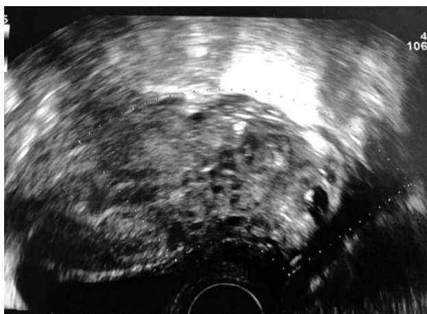
Figure 1. — Transvaginal ultrasound sagittal scan: the scar pregnancy, which protruding out of in bladder, shows a rich vascularization at color Doppler examination.