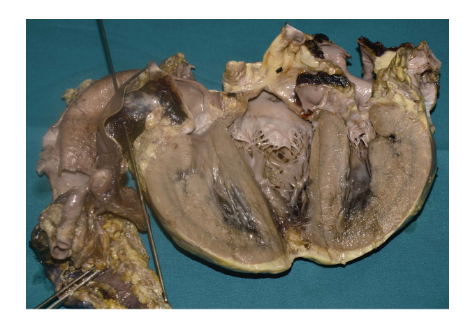
Figure 1. Left ventricular hypertrophy in fixed in formalin heart sectioned according to the "four chambers" method. Enlargement of ascending aorta with dissection involving thoracic aorta and intimal tear in the lateral wall of ascending aorta and adventitial rupture site 3.5 cm above leaflets of aortic valve.