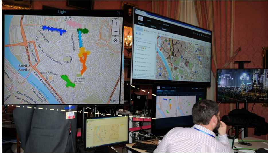
Fig. 2. Command Post of the safety solution in the Seville council for the Holy week.