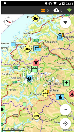
(a) CAGED app showing shared Situational Awareness data [6]