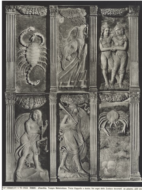
Plate 4 - Segni dello Zodiaco, Tempio Malatestiano.

When Hutton examines the chapels of Saint Jerome and Saint Michael, he explains that the iconographic work encapsulates syncretic beliefs prone to overinterpretation and misunderstandings. The bas-reliefs in the Cappella di Girolamo are not representations of gods but signs of the zodiac, planets, and constellations which in the past used to be attached to divinities [Plate 4].