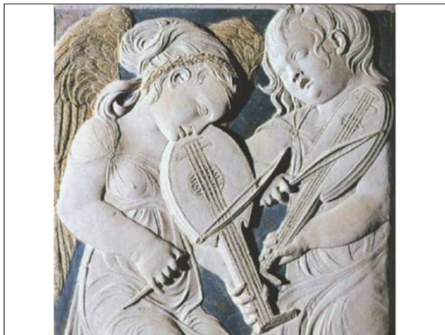
Plate 3 - Tempio Malatestiano, Angels playing and singing.

His comparison between the Italian masters of the early Renaissance and the Victorian artist who was still active in 1880, when Sketches and Studies in Southern Europe was published, is a perceptive reference to the Italian origins of Pre-Raphaelitism. Incrustation is the term Symonds chooses to define the bizarre effect of density and intensity produced by the angels, the statuettes in niches, the personifications of arts and sciences, the satyrs, and the sea-children, filling all the spaces. His finest intuition is that the reliefs mark a particularly interesting moment in the history of modern art: mid-fifteenth-century Italy was characterised by style, variously expressed by sculptors, the poet Boiardo, and the painter Botticelli.