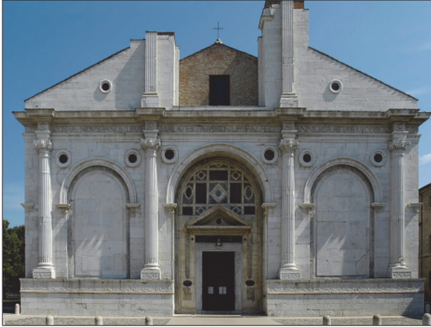
Plate 1 - The façade of the Tempio Malatestiano.