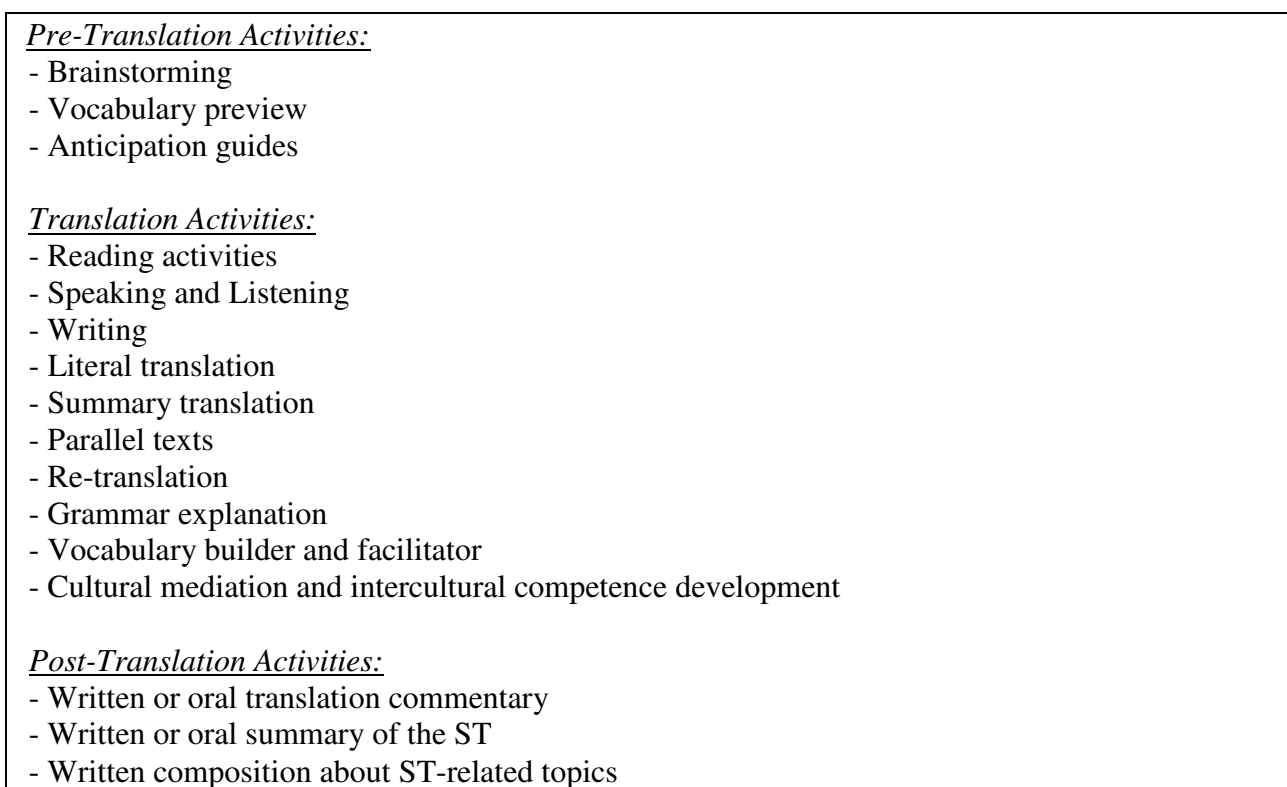
Fig. 1. Pedagogical Translation Framework Basic Structure , adapted from Leonardi (2010, 88).

The PTF is made up of three main types of translation activities which are further divided into sub-groups as also shown in figure 1: