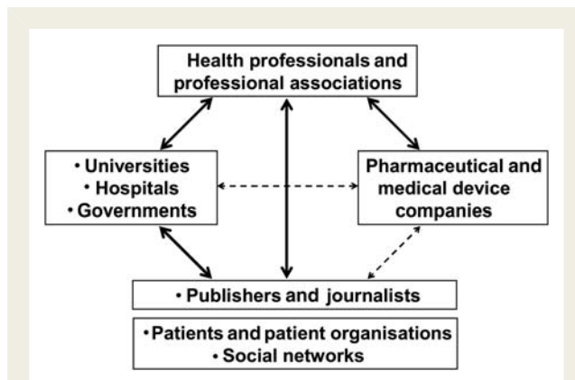
Figure 1 Links between providers of continuing medical education and scientific communications. Solid arrows indicate the preferred channels of communication; dotted arrows are those links where an added impartial expert commentary could be useful.

The ESC also organizes five subspecialty congresses, meetings dedicated to basic research, and clinical CME courses. Its website (escardio.org) offers educational resources such as e-learning