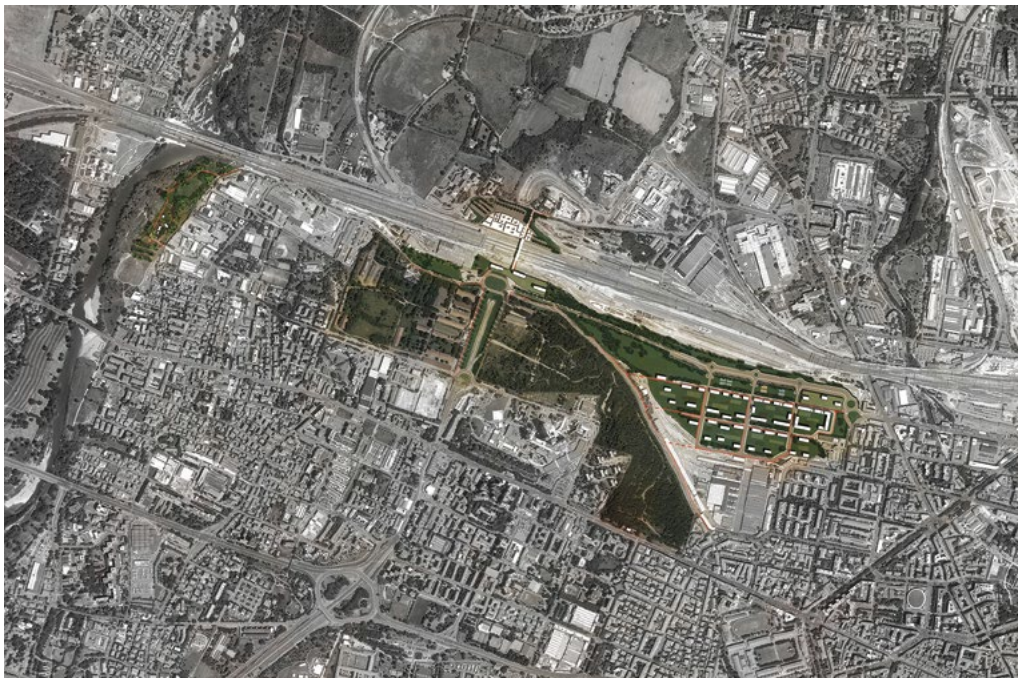
2: Masterplan of the area in the final version of the Operational City Plan [Author's drawing].