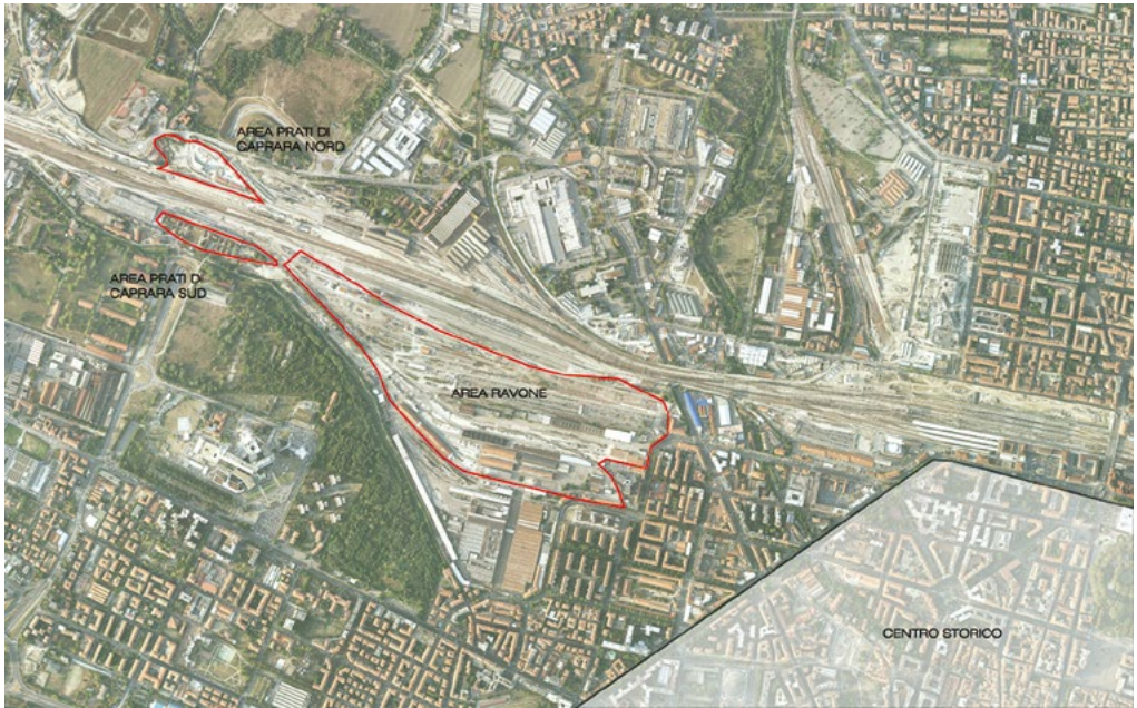
1: General layout of the Ravone area [Author's map].