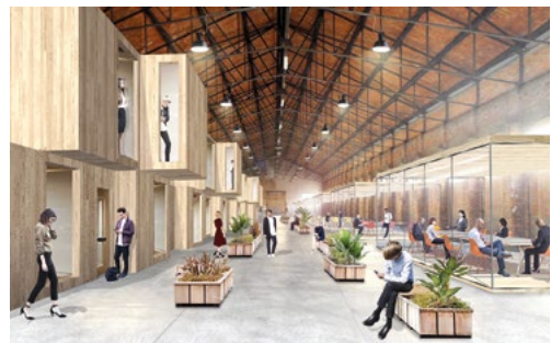
4: Scenario for the temporary use of the depot for co-working activities [Author's photo and project view].