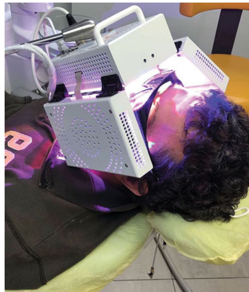
FIG. 1. The ATP38 ® (Biotech Dental, Allée de Craponne, Salon de Provence, France) was used in this study to perform PBM. See the three panels placed at a 4 cm distance from the patient's cheeks (lateral panels) and lips (frontal panel). PBM, photobiomodulation.

PBM was administered to the PBM group using the ATP38 ® (Biotech Dental, Allée de Craponne, Salon de Provence, France). This device features a multi-panel system emitting cold polychromatic lights with a combination of wavelengths from 450 to 835 nm depending on the field of