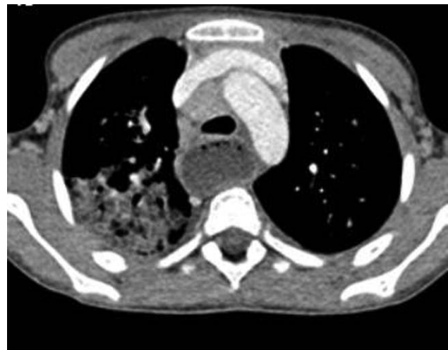
Figure 1. Chest computed tomography scan showing right parenchymal lobar pneumonia associated with air bronchogram, diffuse “ground glass” images, multiple mediastinal enlarged lymph nodes, and a dilated esophagus filled with solid material.

After a detailed history-taking, the parents reported progressive dysphagia, failure to thrive, weight loss during the last