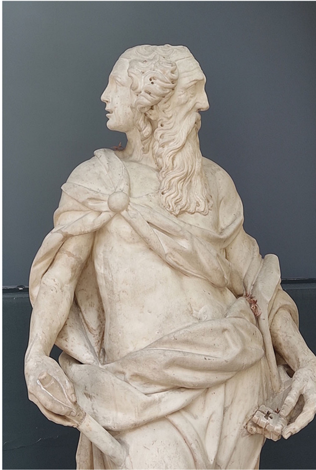
FIGURE 1 | Statue of Janus Bifrons, Museo de San Isidro, Madrid, Spain.

“ nomen omen ” indeed feels appropriate. Janus could see the future—something we cannot. But perhaps his younger face is gazing upon a future where new JAK inhibitors will be developed, and even more patients will benefit from this evolving class of medications.