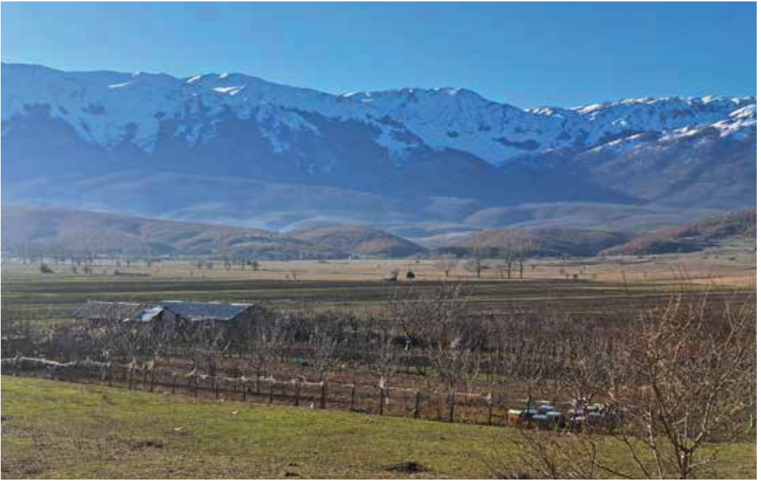
Fig 17 : Landscape view of Pustec