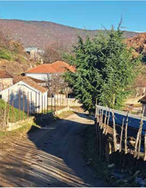
Fig 4/ : Village context