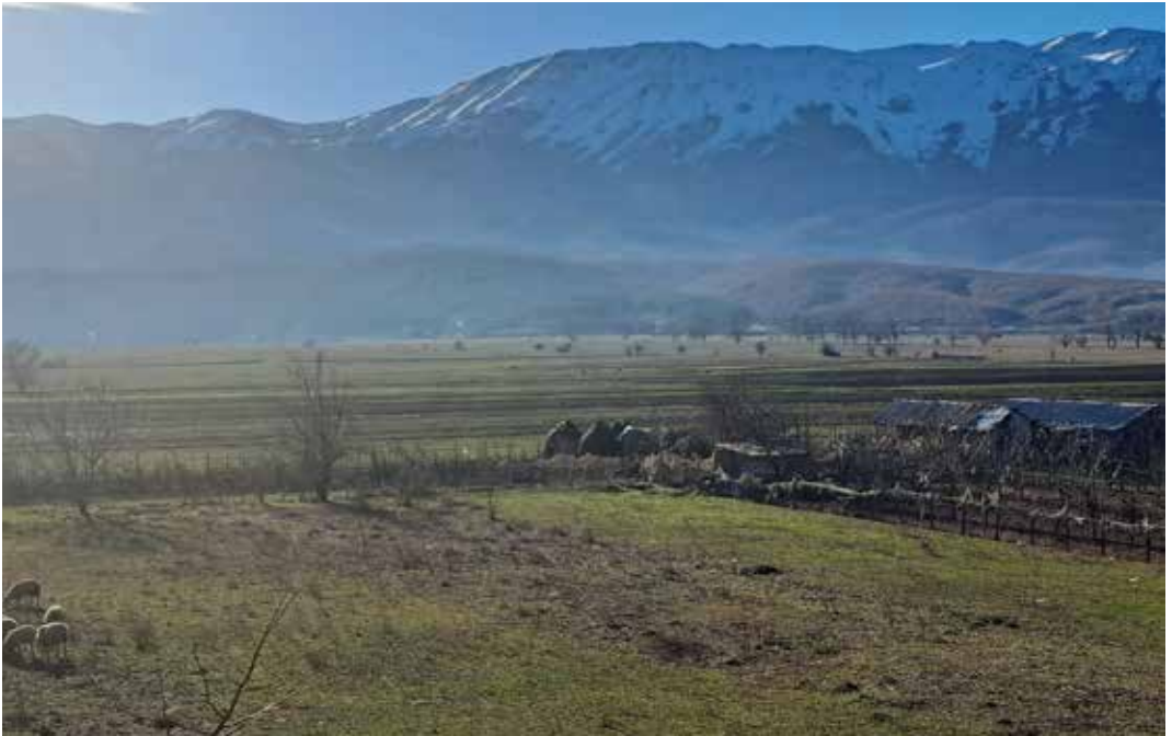
Fig 2/ : Landscape view of Pustec