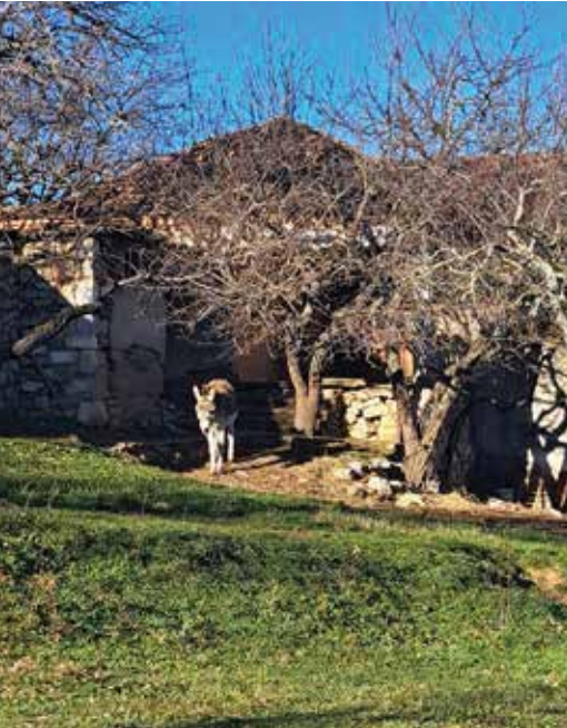
Fig 3/ : Village context