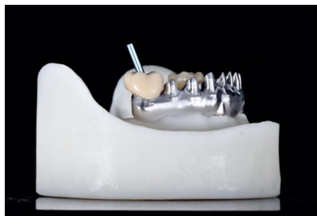
Figure 2. CAD/CAM Cr-Co Milled Framework.