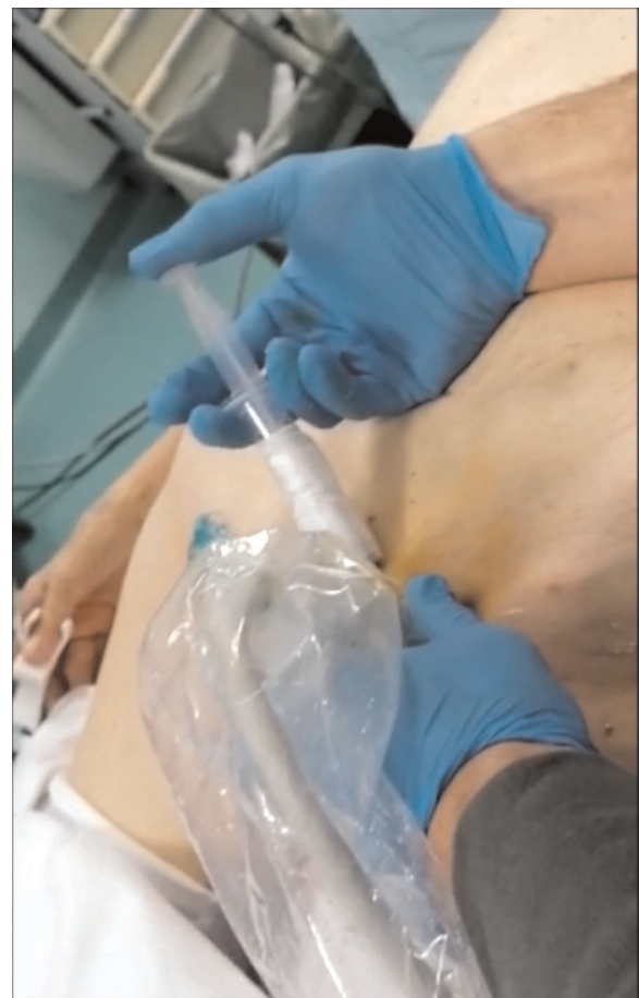
FIGURE 1 | A dose 0.5 mg/kg of ICG is injected percutaneously bilaterally in the superficial inguinal nodes under ultrasound visualization. This procedure is performed before thoracoscopy in total esophagectomy, or after laparoscopic time in Ivor Lewis esophagectomy.

The potential future and potential developments of the use of ICG in lymph node mapping during esophagectomy mainly concerns the standardization of this technique during intervention. This approach has now been proven to be safe, but further research is needed before it can be used on a regular basis.