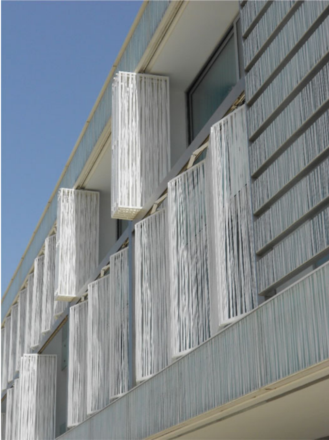
Fig. 26.3 Metallic louvers, office buildings in Lisbon.

materials and technologies equipped with smart functions in terms of purpose, operation mode, or adaptivity toward the external variations, considering also the relevant physics of the system or the adaptation scale (Loonen et al. 2013).