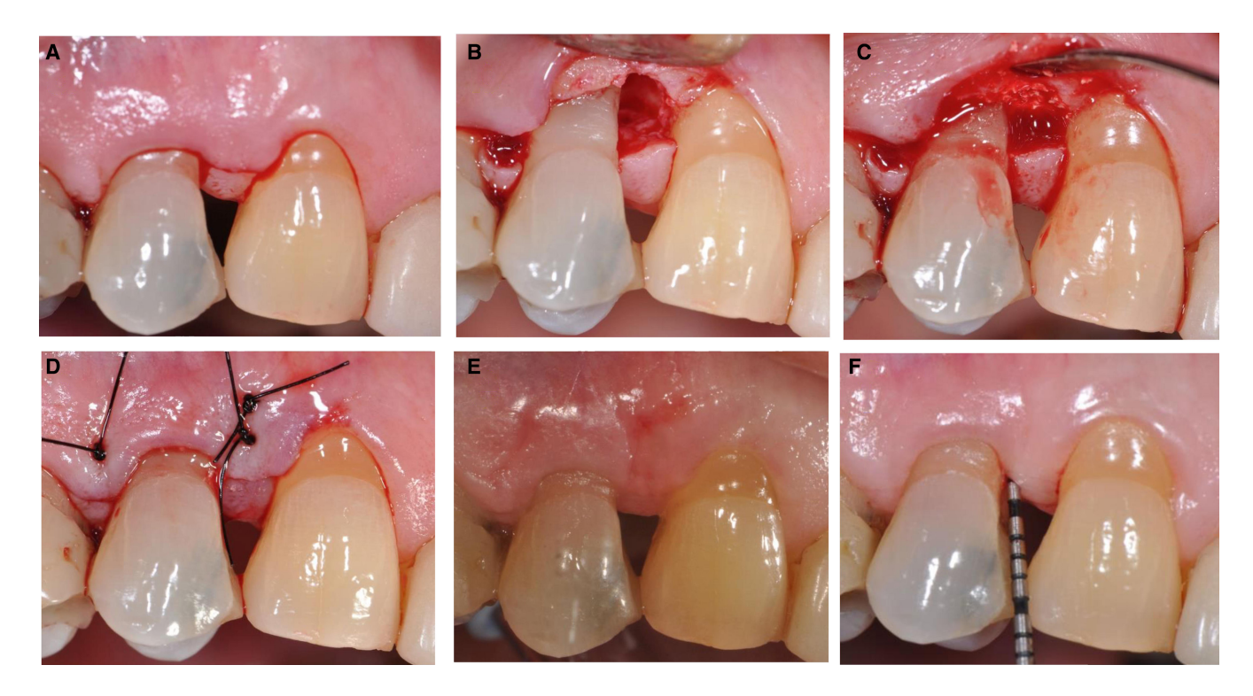
FIGURE 2 Treatment of a periodontal intraosseous defect with a buccal Single Flap Approach (Trombelli et al<sup>17,18</sup>) and rh-PDGF-BB plus β-TCP. A, A buccal envelope flap without vertical releasing incisions is elevated. Sulcular incisions are made following the gingival margin of the teeth included in the surgical area. The mesio-distal extension of the flap is kept limited while ensuring access for defect debridement. An oblique or horizontal, butt-joint incision is made at the buccal aspect of the interdental papilla overlying the intraosseous defect. An adequate amount of supracrestal soft tissue remains connected to the undetached papilla to ensure subsequent flap adaptation and suturing. B, A microsurgical periosteal elevator is used to raise a flap only on one side (buccal or oral), leaving the other portion of the interdental supracrestal soft tissues undetached. C, The intraosseous component of the defect is filled with \beta -TCP mixed with rh-PDGF-BB. D, For wound closure, a horizontal internal mattress suture is placed between the flap and the base of the attached papilla to ensure repositioning of flap. A second internal mattress suture (vertical or horizontal) is placed between the most coronal portion of the flap and the most coronal portion of the papilla as needed. E, Clinical aspect at suture removal (2 wk postsurgery). F, At 6 mo postsurgery, pocket probing depth amounts to 4mm (reprinted from Schincaglia et al<sup>21</sup>). β-TCP, beta-tricalcium phosphate; rh-PDGF-BB, recombinant human plateletderived growth factor-BB

postsurgical period (from day 1 to day 14 after surgery) after the Single Flap Approach compared with the Double Flap Approach, with the intergroup difference reaching statistical significance at the early observation intervals (day 1 at 08:00 a.m., 01:00 p.m., and 08:00 p.m.; day 2 at 01:00 p.m. and 08:00 p.m.) and on the sixth day after surgery. A significantly higher dose of self-administered rescue analgesic (ie, 600-mg ibuprofen tablets) was registered on day 1 after treatment in the Single Flap Approach group compared with the Double Flap Approach group (1.1 \pm 2.2) and 3.2 \pm 2.9 , respectively; P = .019). The mean dose of analgesic taken within the first 2 postoperative weeks was 2.73 \pm 5.04 and 8.69 \pm 11.6 in the Single and Double Flap Approach groups, respectively, with the difference not reaching statistical significance. These results were ascribed, at least in part, to the better quality of early wound healing at the incision margin, as observed in the Single Flap Approach group at 2 weeks following surgery. In particular, 53% of sites accessed according to the Single Flap Approach showed optimal wound closure (ie, Early Healing Index ^{56} = 1 ), while only 23% of sites in the Double Flap Approach group showed the same quality of healing.