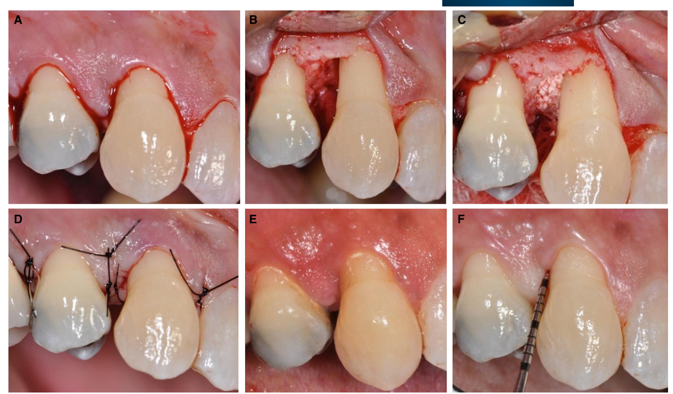
FIGURE 3 Treatment of a periodontal intraosseous defect with a Double Flap Approach (SPPF; Cortellini et al<sup>55</sup>) and rh-PDGF-BB plus β-TCP. A, An envelope flap without vertical releasing incisions is elevated on either the buccal or palatal aspect. Sulcular incisions are made following the gingival margin of the teeth included in the surgical area. The mesio-distal extension of the flap is kept limited while ensuring access for defect debridement. An incision is made at the buccal aspect of the interdental papilla overlying the intraosseous defect according to the SPPF. ^{55} B, A microsurgical periosteal elevator is used to raise a flap on both buccal and palatal sides. C, The intraosseous component of the defect is filled with \beta -TCP mixed with rh-PDGF-BB. D, Primary closure is achieved according to the suturing technique of the SPPF.<sup>55</sup> First, a horizontal, "offset" internal mattress suture is placed in the defect-associated interdental space. The interdental tissue above the defect is then closed with two interrupted sutures. E, Clinical aspect at suture removal (2 wk postsurgery). F, At 6 mo postsurgery, pocket probing depth amounts to 3 mm (reprinted from Schincaglia et al ^{21} ). \beta -TCP, beta-tricalcium phosphate; rh-PDG-BB, recombinant human platelet-derived growth factor-BB; SPPF, simplified papilla preservation flap