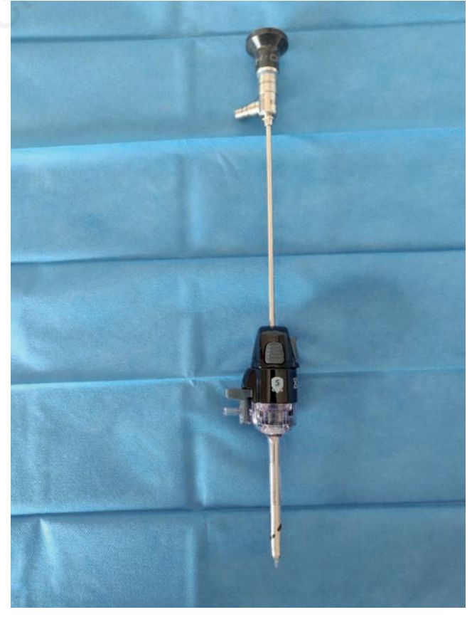
Figure 3. Assembly of thoracoport and camera lens ready for procedure.