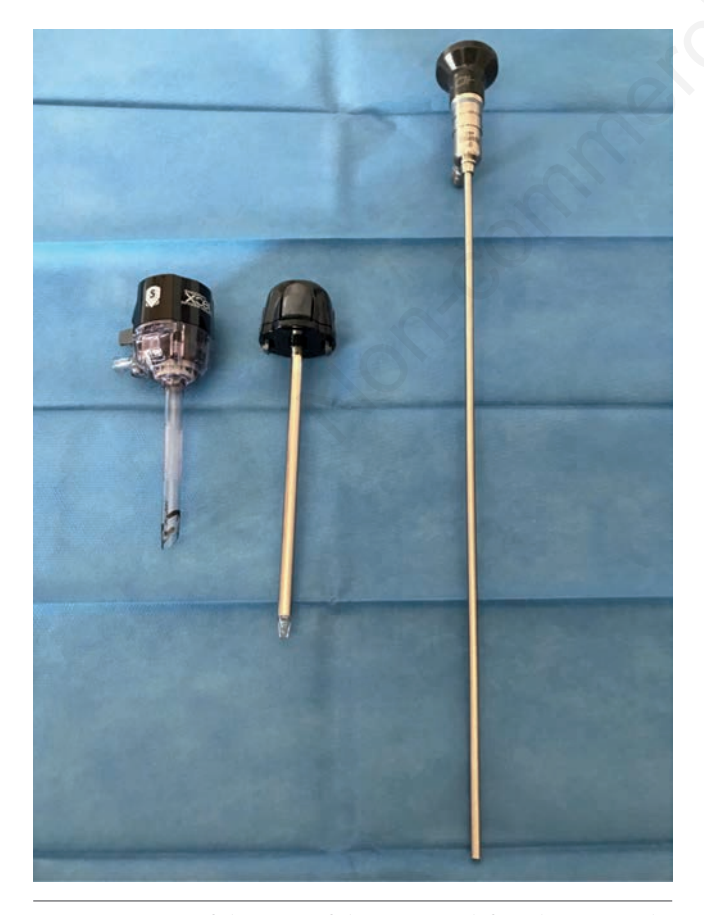
Figure 2. Image of the parts of thoracoport (left and centre tools) and the camera lens (right tool).

This modified technique of dry thoracoscopy using zerodegree camera lens with the thoracoport using local anaesthetic agents with moderate sedation can be effectively used to manage such cases on a day care basis with early patient recovery and early post procedure discharge.