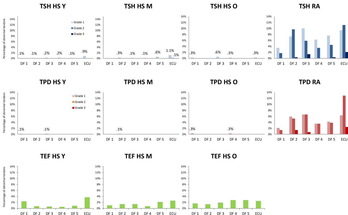
Figure 1 Percentage of tendons with grade 1–3 TSH and TPD, and presence of TEF in DF tendons 1–5 and ECU for HS according to age groups, compared with patients with RA. TEF measured only in HS. HS Y, 18–39 years; HS M, 40–59 years; HS O, 60–80 years. DF, digit flexor; ECU, extensor carpi ulnaris tendon; HS, healthy subjects; M, middle; O, old; RA, rheumatoid arthritis; TEF, tenosynovial effusion; TPD, tenosynovial power Doppler; TSH, tenosynovial hypertrophy; Y, young.

unselected primary or secondary care early arthritis clinics or in osteoarthritis, but to assess if HS with no symptoms may have ultrasound inflammatory abnormalities. The lack of a formal reliability study which would have been logistically difficult in such a large study, and the consecutive, not blinded recruitment may be seen as potential limitations. We mitigated these by designing a blinded central regrading strategy of the first HS scan performed by each centre. 20